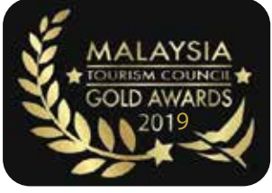
BEST TOURISM INITIATIVE EVENT